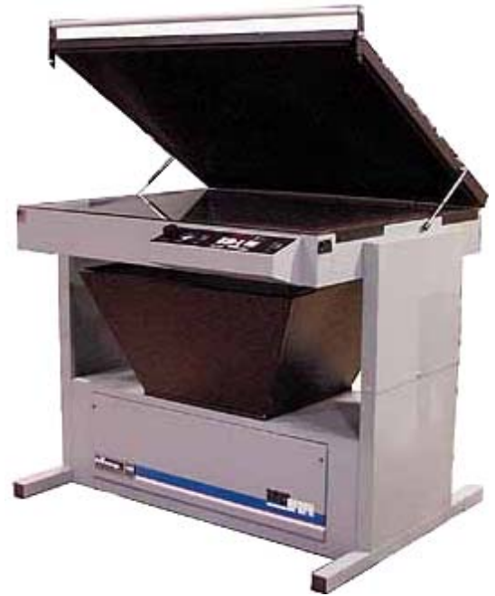
Metal Halide Exposure unit AM-150

Touch Activated, User Friendly Keypad & LED Digital Display