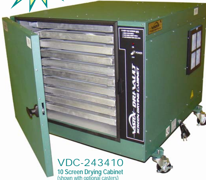
VDC-243410 10 Screen Drying Cabinet (shown with optional casters)

E2227 exposure unit fits perfectly on top of 10 screen drying cabinet to save space.