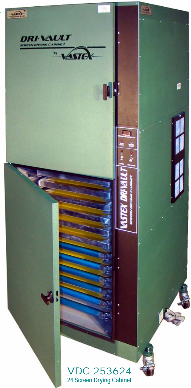
VDC-253624 24 Screen Drying Cabinet